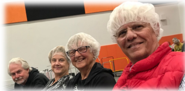
Left: FMSC It was fun to be a part of making a difference.