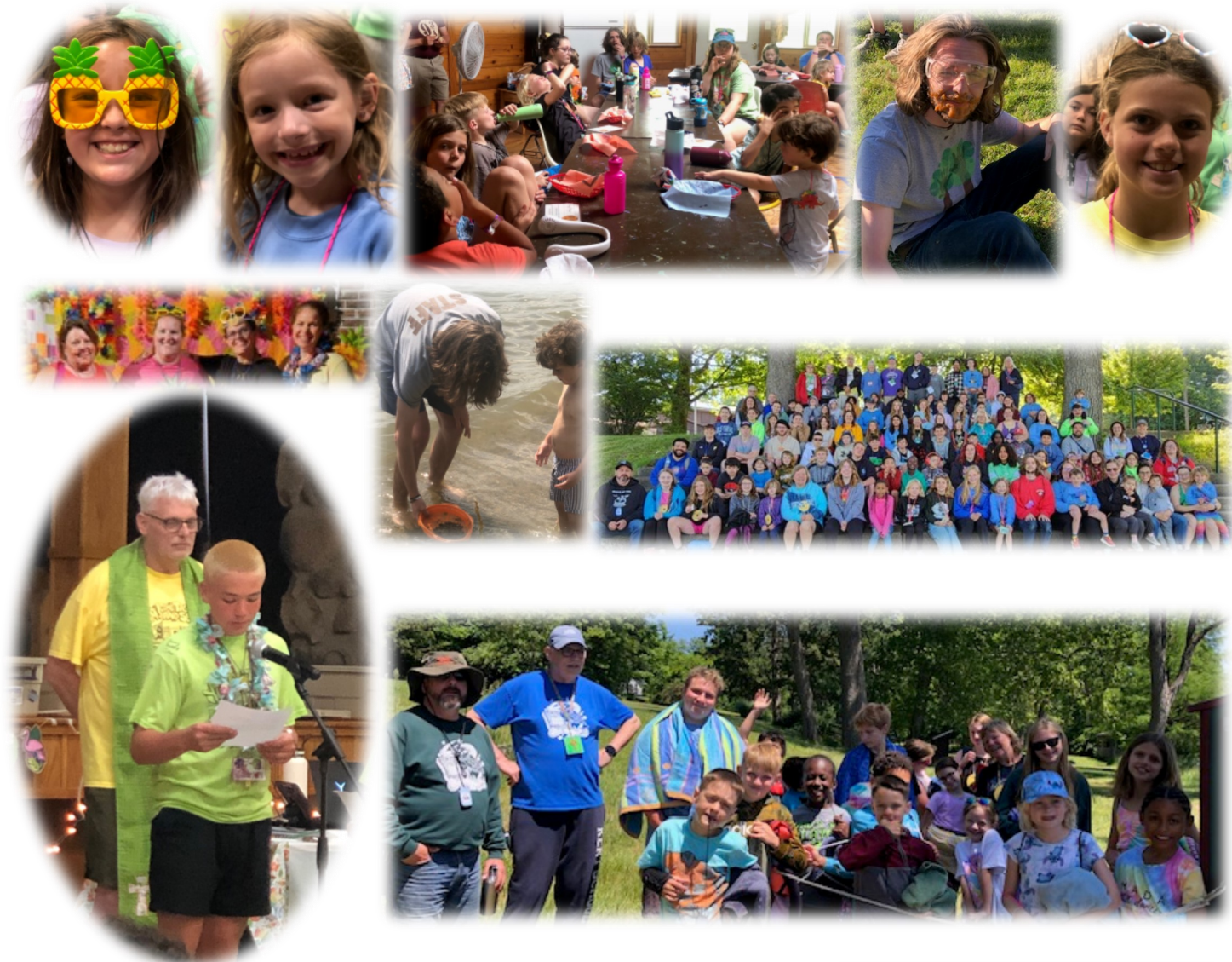
Pictured above: St. Anne’s youth and friends at summer camp.