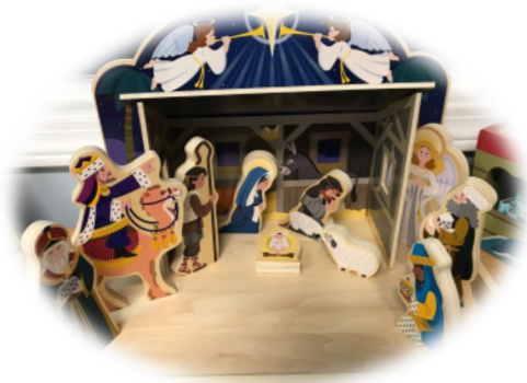
Christmas Eve Mass December 24, 2024 7 p.m.