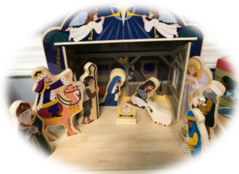
Christmas Eve Mass December 24, 2022 7 p.m.