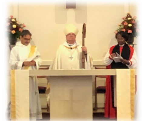
Above and below: Pictures from Diocesan Convention 2024 hosted by St. Anne's.