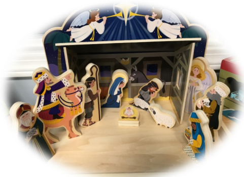
Christmas Eve Mass December 24, 2025 7 p.m.